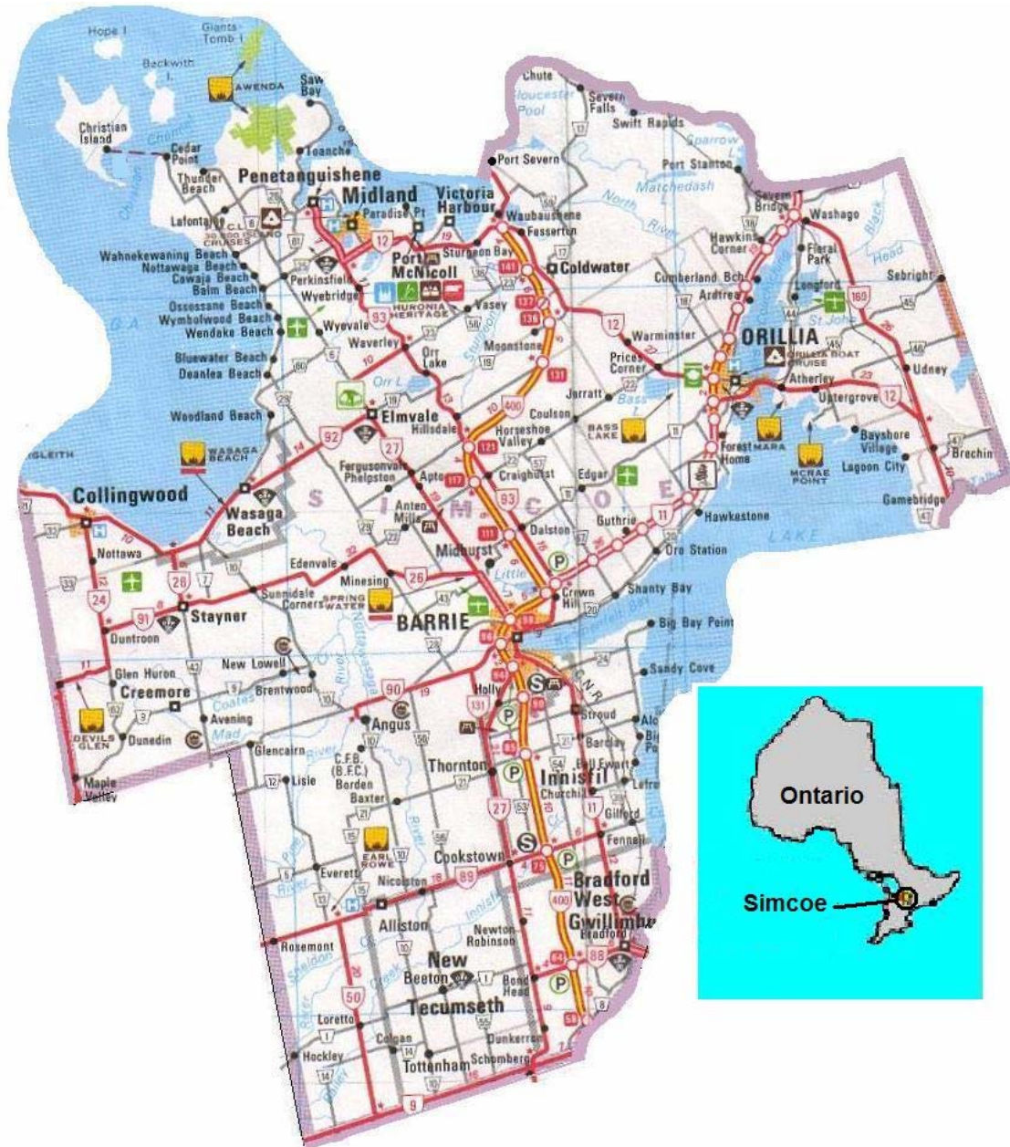
Map of Simcoe County

As reported in the 2001 Census of Canada, the total population of Simcoe County was 377,050 3 . Roughly one-half lived in the urban communities of Barrie (pop. 103,710), Orillia (pop. 29,120) Midland - Penetanguishene (pop. 24,530) Collingwood (pop. 16,040) and Wasaga Beach (pop. 12, 420). The remaining one-half live in small towns, villages, hamlets and on farms throughout the County.